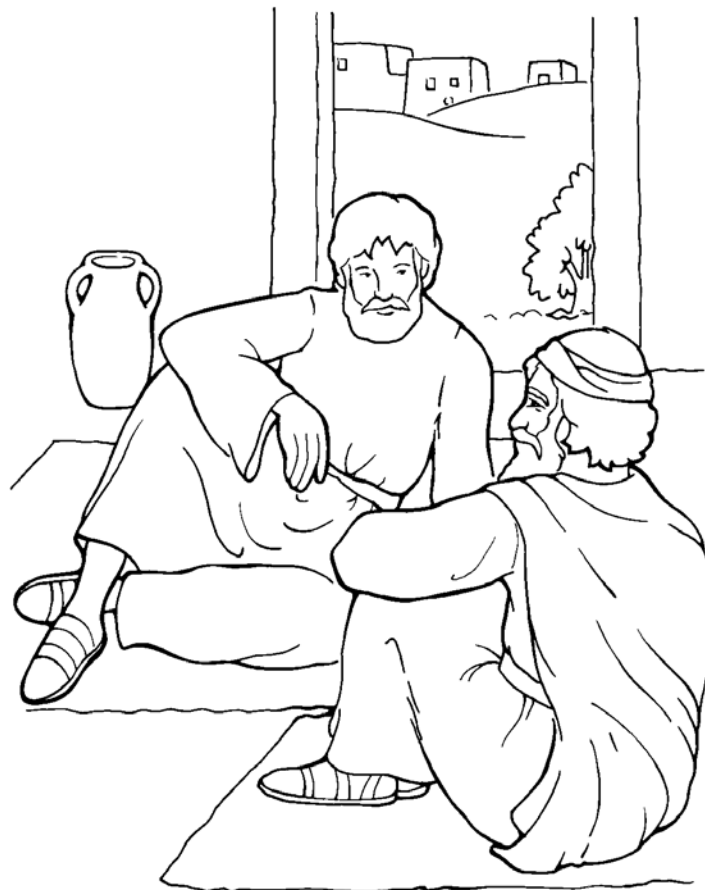
PAUL SHARING THE GRACE